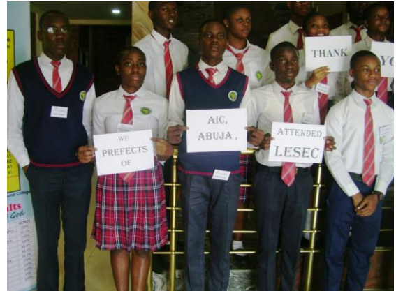
Prefects of Africa International College, Abuja