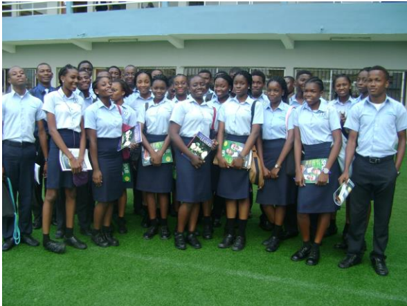
Prefects of Dansol High School, Lagos in one of the Training sessions of LESEC

...A Value-based training for Senior School Prefects, running since 1998